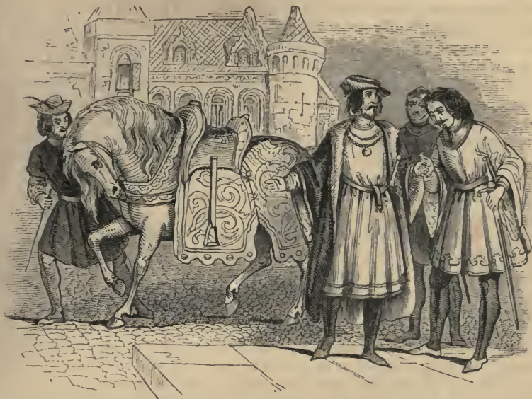
DUKE OF BRITTANY presenting Count d'Estampes with "a handsome white palfrey, saddled and equipped as if for a king." Designed from MS. illumination of the 15th century.

whatever they might be. The duke of Berry, seeing nothing better could be done, made light of it, and, shortly after, returned to the king and the duke of Burgundy, to relate to them the ill success of the journey the count d'Estampes had undertaken, at his request, to Brittany. As they saw they could not do more, affairs remained in this state.